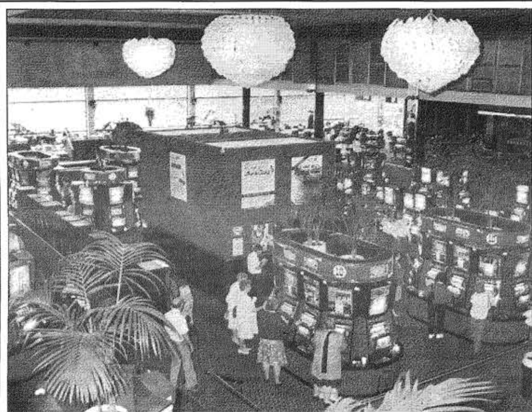
• The way it was... the old gaming room, complete with its red and pink colour scheme and large chandeliers, has made way for a sparkling array of light and colours in the new-look "Rivers of Gold" gaming lounge.